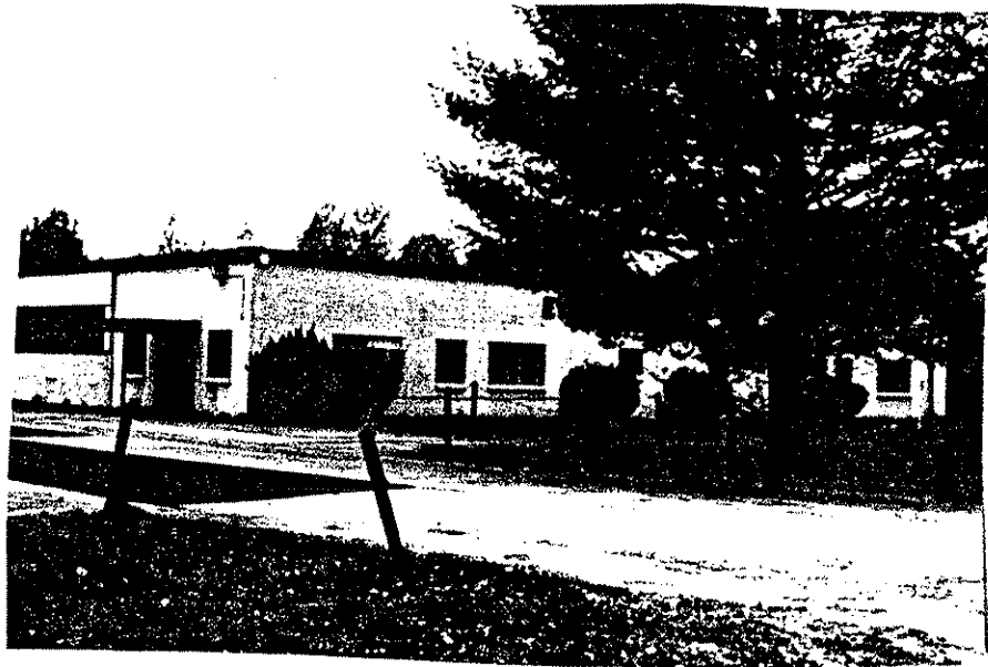
Evans Shoe Co. Hampden, Mayo Rd. East (road) elevation